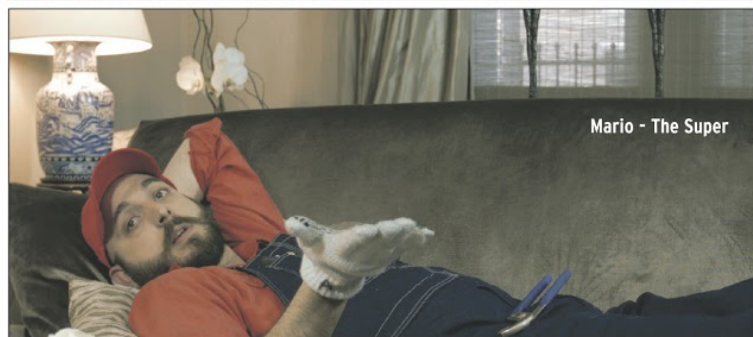
Mario - The Super